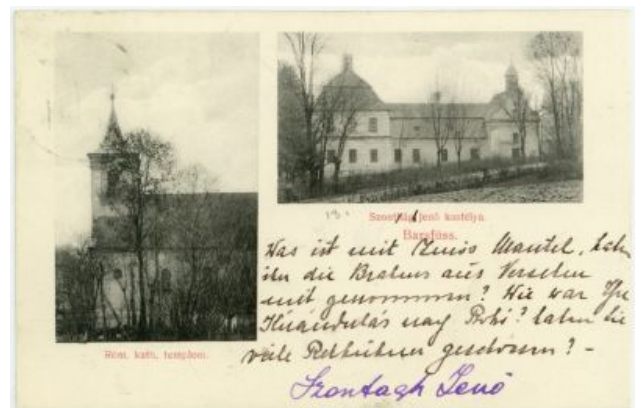
Római kápt. templom