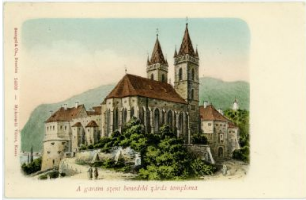
A garami szent benedeki zirci templomja