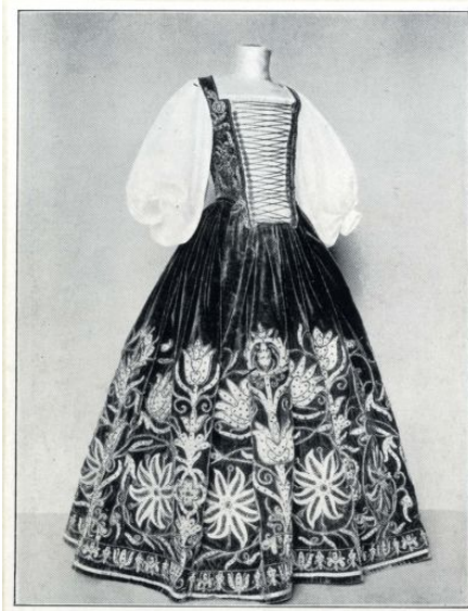
No. 10. Costume de gala d'Eve Thokoly, femme du palatin Paul Esterházy (1672). Prince Paul Esterházy.